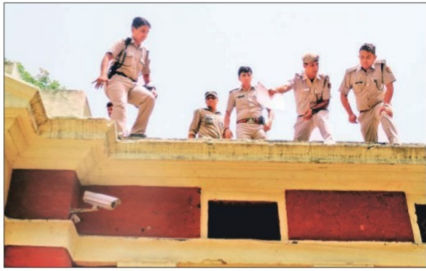
Police at the school in north Delhi on Wednesday.