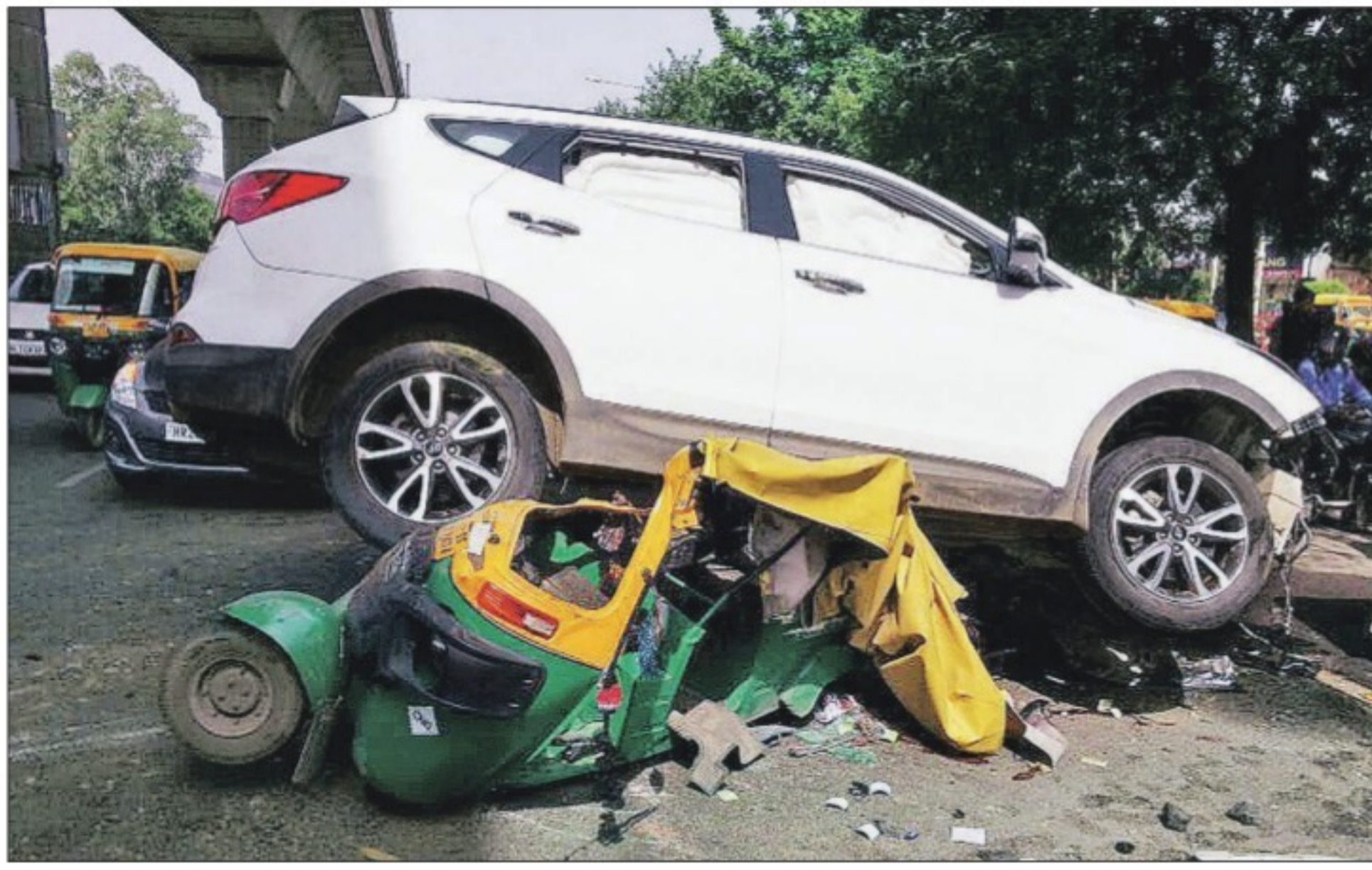
The SUV, whose driver was hit by a bullet, broke through a divider and landed on an autorickshaw.