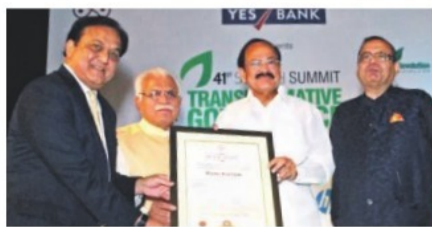
Rana Kapoor , Managing Director & CEO, YES Bank, President, ASSOCHAM; and, Chair, National Mission on Smart Cities, Infrastructure & Industrial Corridors, CII receives an Award for Contributions to Public Policy